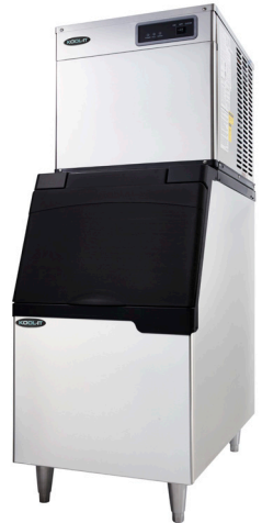
Bin KB-260-22 shown above is not included - sold separately